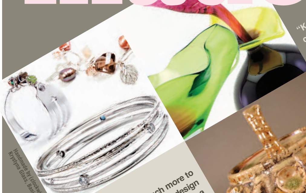
Handmade by (clockwise): Danielle O'Connor Jewellery, Krystyna Glass, Banished Moon Pottery