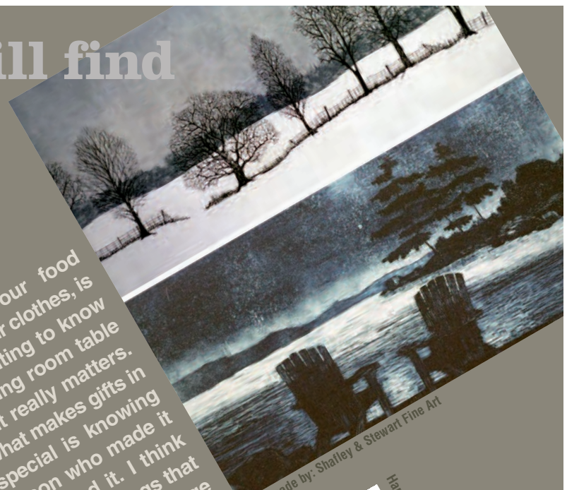
Handmade by: Shatley & Stewart Fine Art

"Knowing where your food comes from, or your clothes, is extending to wanting to know where your dining room table comes from. It really matters. And I think what makes gifts in particular special is knowing there's a person who made it and a story behind it. I think people want to buy things that tell stories, especially in an age when so few store-bought items tell stories."